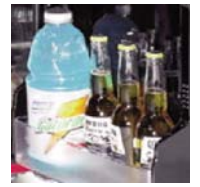
Large Bottle Storage